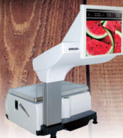
Optional 12" or 15" rear screen