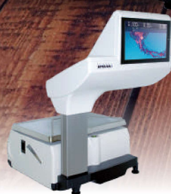
9" rear screen