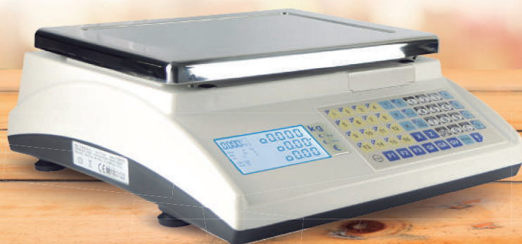
Plate dimensions: Length (35,5 cm) - Width (26 cm) - Height (2cm)