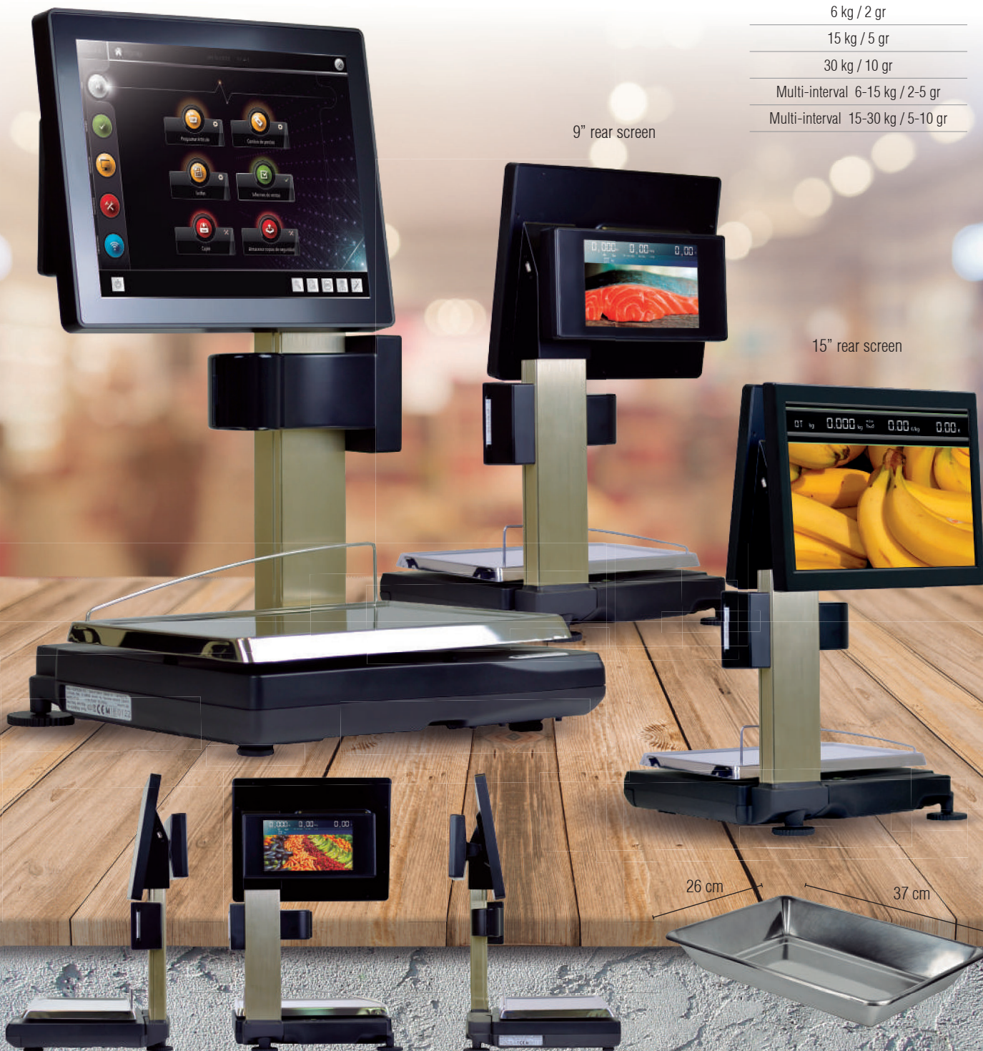
Stainless steel hollow plate