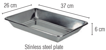
Stainless steel plate

Plate dimensions: Lenght (36 cm) - Width (26,5 cm) - Height (2cm)