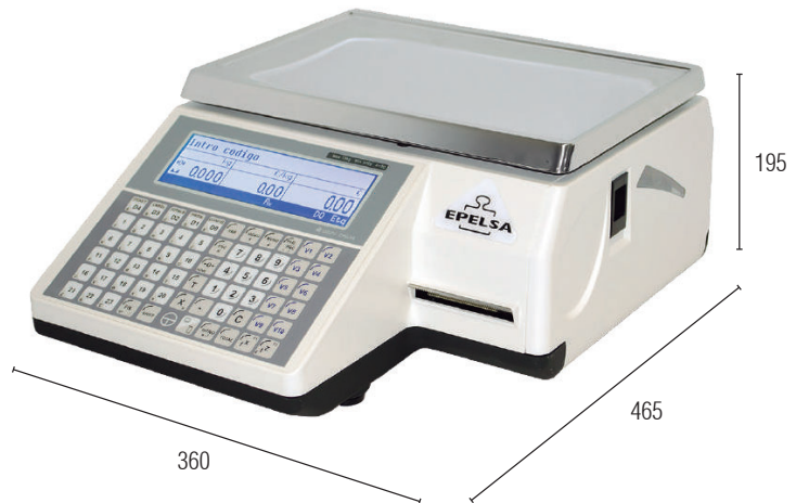
Plate dimensions: Length (35,5 cm) - Width (26 cm) - Height (2cm)